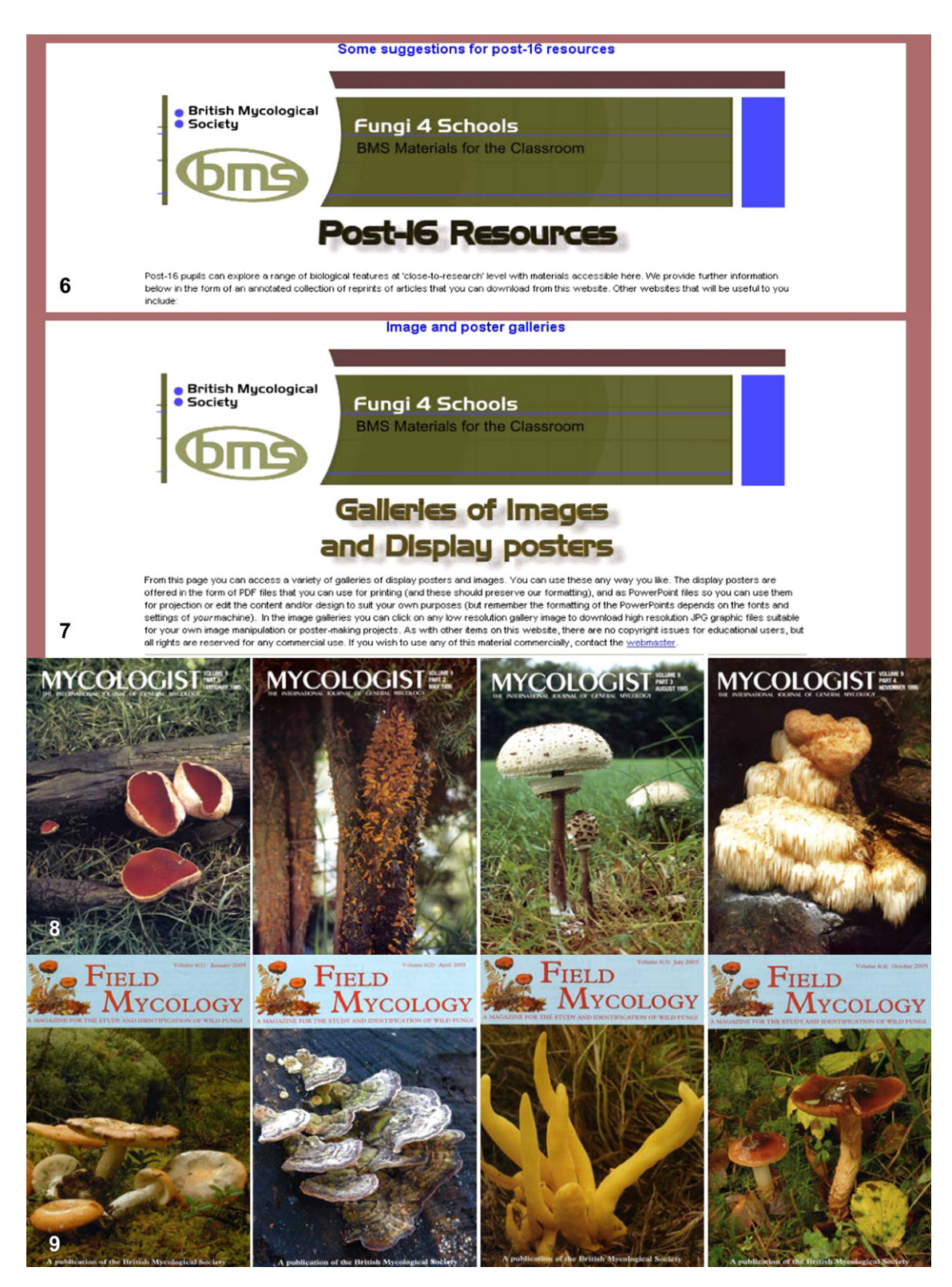
Figs 6-7 - Screenshots of fungi4schools web pages. Fig. 6 - the Post-16 page. Fig. 7 - Page offering galleries of posters, graphics and photographs. Fig. 8 - Mycologist covers from 1995. The fungi4schools website features 35 cover illustrations like this. Fig. 9 - Field Mycology covers from 2005. There are 24 Field Mycology cover illustrations on the fungi4schools website.