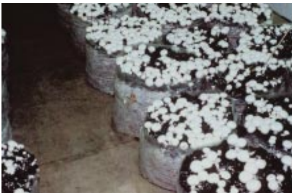
Mushrooms grown using bought-in bags of compost

Buying ready-spawned (Phase II) compost bypasses expensive capital investment in machinery and buildings necessary for the skilled Phase I and Phase II composting processes. Bought-in compost can then be grown on in bags, on shelves or as compressed blocks. Some growers buy in fully prepared compost which is ready for casing. So called 'Phase III' compost is more expensive but can yield particularly well, increasing cash flow and retained income. However, it will also require a higher level of working capital. The choice of system will ultimately reflect availability of capital, facilities and site restrictions and can be decided only in the course of a detailed financial analysis.