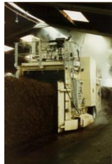
Compost production: probably best avoided for small farms

The majority of newcomers now choose to buy in pre-prepared compost. This avoids the complexity, pollution potential and cost of compost manufacture.