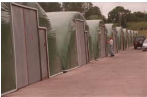
A modern farm blends with its environment.

Once the compost has been fully colonised an extra layer, usually of peat, is added to the surface. This so called 'casing' layer mimics the function of an autumn leaf-fall and provides conditions for transforming A bisporus to reproductive growth. With a combination of changes in the cropping environment as the grower reduces carbon dioxide levels and temperature, as would occur naturally in autumn, the crop changes to reproductive generation of mushrooms.