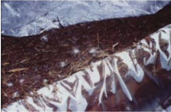
A bisporus growing into compost from commercial spawn

Today A bisporus is introduced to compost as a culture bought from a small number of highly specialised biotechnology companies. Most such companies provide spawn as a fungal culture of A bisporus which has colonised sterilised grain. This gives an easily handled product readily broken into granules for distribution in the compost.