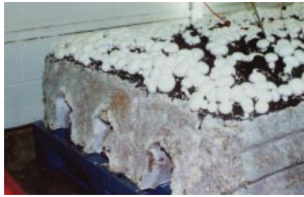
Mushrooms produced from the casing layer overlaying compost. In this example compost has been compressed into large blocks.

There are a wide range of openings for disease-causing fungi, bacteria and viruses to enter the cropping cycle. Many of the most damaging diseases are related to species that A bisporus needs to complete its life cycle and so may never be eliminated. Constant effort is needed to ensure crops remain healthy.