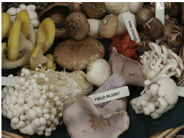
Fig. 6 – Just a few of the exotic mushrooms provided by Livesey Brothers for the Chelsea Flower Show 2006.

don't have to be a University academic to understand this, you could learn about this science, too." In addition, development of support materials involves undergraduates doing projects in association with Manchester schools and museums – so the effort serves as a vehicle to bring young university students into the effort to improve public understanding of fungal science.