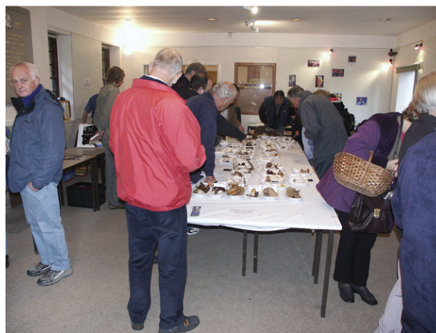
Fig. 10 – BMS Roadshow adapted and adjusted for the MYFG Mushroom Day at Harlow Carr Garden Study Centre, October 2005. Bottom: visitor activity and interest around the display of foray finds in the Harlow Carr Garden Study Centre.

children during the day, and both the RHS shop and the Gardens Restaurant put "Mushroom Day-themed" products on sale. We had 1157 visitors in 2005 (a 36% increase over 2004). Interestingly, RHS increased their membership on the day by 20, so everybody's satisfied and this year's date (October 8, 2006) is firmly in the diary!