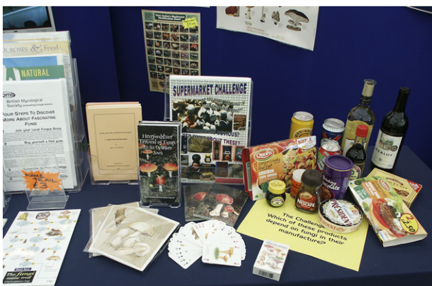
Fig. 7 – Display literature. Top: Leaflets, booklets and books. Bottom: A few more leaflets alongside the ever-popular 'Supermarket Challenge'.