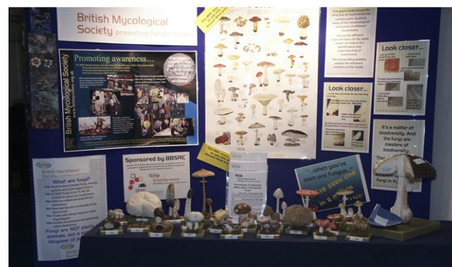
Fig. 8 – The BMS Roadshow at ASE 2005: Leeds in January. Showing the BMS literature and models displayed in a marquee during a raging storm!