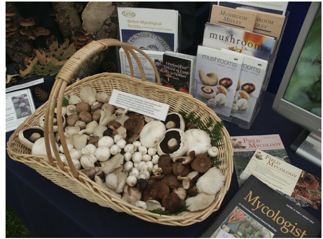
Fig. 4 – Mushrooms from Tesco - with recipe leaflets from the Mushroom Bureau.

growing shiitake ( Lentinula edodes ) (Fig. 3) alongside a basket of the different mushrooms available at our local supermarket (Fig. 4). Together, these generated lots of interest from the crowds. For the Chelsea Flower Show in 2006 the Livesey Brothers Mushroom Farm (see www.themushroombasket.com ) delivered regular fresh supplies of an impressive collection of exotic mushrooms for us to collect from New Covent Garden market (Figs 5 & 6).