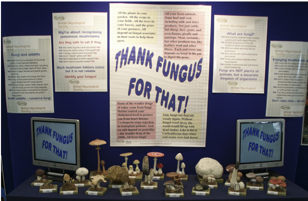
Fig. 2 – The BMS Roadshow models and the main message for 2005 and 2006 – ‘Thank Fungus for That!’