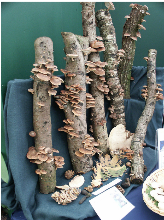
Fig. 3 – Shiitake logs provided by Ann Miller for the Tatton Park 2005 display.

Communication is paramount, of course, so even more important than a wide collection of posters, leaflets, and video is a team of display staff, who work their hearts out explaining, chatting, advising, and generally sharing their own enthusiasm for fungi and become the greatest asset on the Roadshow by putting the fun into fungi. The material displayed on the Roadshow begins the conversation, but there is such a wide range of material (covering matters from food to health, from the environment to the home) that the conversation can be developed in many different directions. It’s important, too, that we have managed to keep a balance of academic and field mycologists by involving members of Local Fungus Groups. This is important because it makes it clear to the general public that our science is not exclusive. By having “amateurs” in the display team we are saying to the public “you