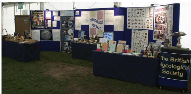
Fig. 9 – Roadshow display at the Malvern Autumn Show, 2005.

There's a smaller audience for the Mid-Yorkshire Fungus Group's Mushroom Day at the RHS Harlow Carr Garden (a Sunday near October 10) but it's going from strength to strength (Fig. 10). Now in its third year, there has been a noticeable increase in attendance, and in level of interest among the visitors. Indeed, people seem to come for repeat visits, bringing specimens for identification and treating the foray and exhibition organisers as old friends. Its success is a tribute to the organisers and results from the wide range of activities offered to the public. This is a good model for other Local Fungus Groups to follow. MYFG members lead fungal forays around the garden, and offer an advice and identification service. Such is the level of interest that both of these activities are always over-subscribed. There is a display of freshly collected specimens, which is started off by material collected previously by MYFG members, but is soon greatly expanded as the forays around Harlow Carr get under way and as visitors bring in specimens for identification. Other displays include cooking, "grow your own" edible fungi, photography, and, of course the BMS Roadshow's educational displays. A range of activities are arranged for