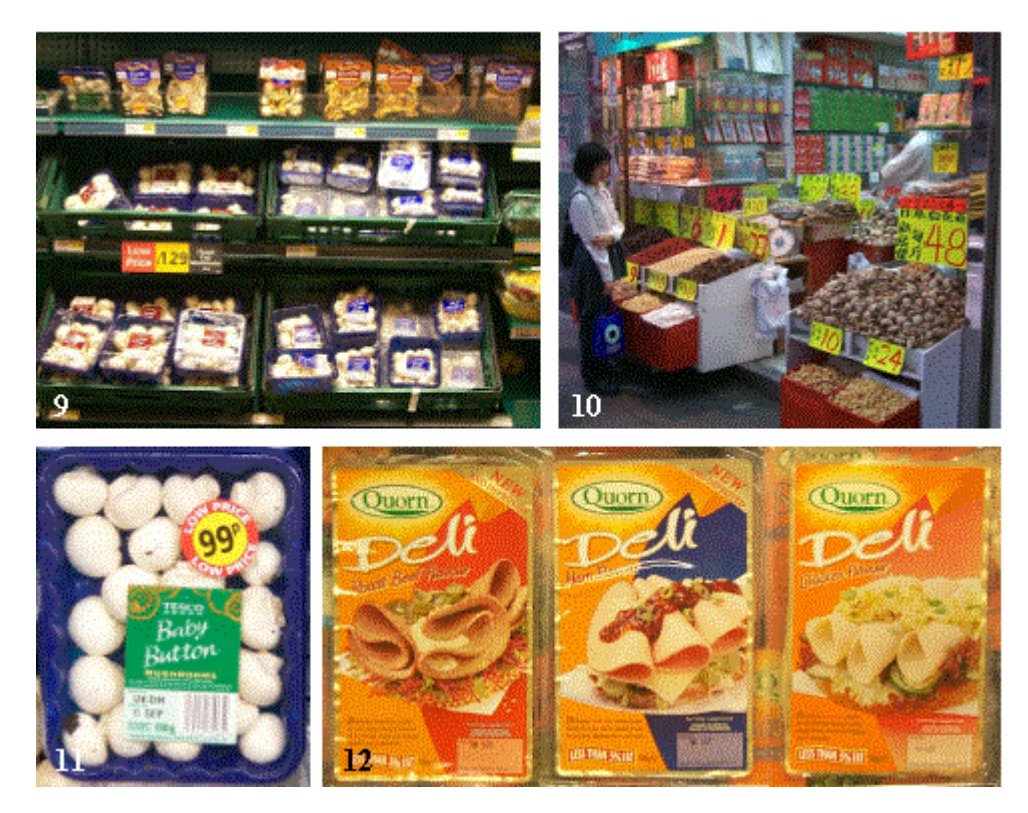
Figs 9 - 12. Point of sale. Fig. 9 , supermarket mushrooms in Didsbury, Manchester. Fig. 10 , selling mushrooms in Nathan Road, Hong Kong. Figs 11, 12. Fungi as food for sale in Manchester. Fig. 11 , fresh Agaricus bisporus button mushrooms in their natural state. Fig. 12 , three packs of Fusarium venenatum (previously called Fusarium graminearum ) pretending to be meat.