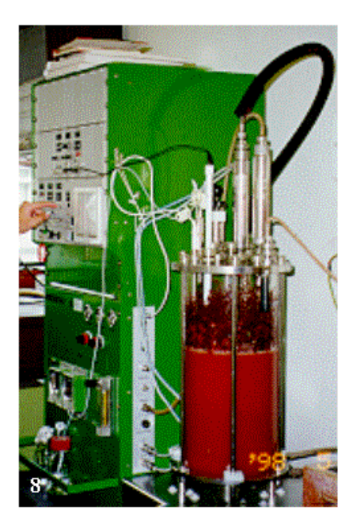
Fig. 8. Fermenter growth of fungi. An experimental fermenter growing Monascus purpurea in the laboratory in the Biology Department, Chinese University of Hong Kong.